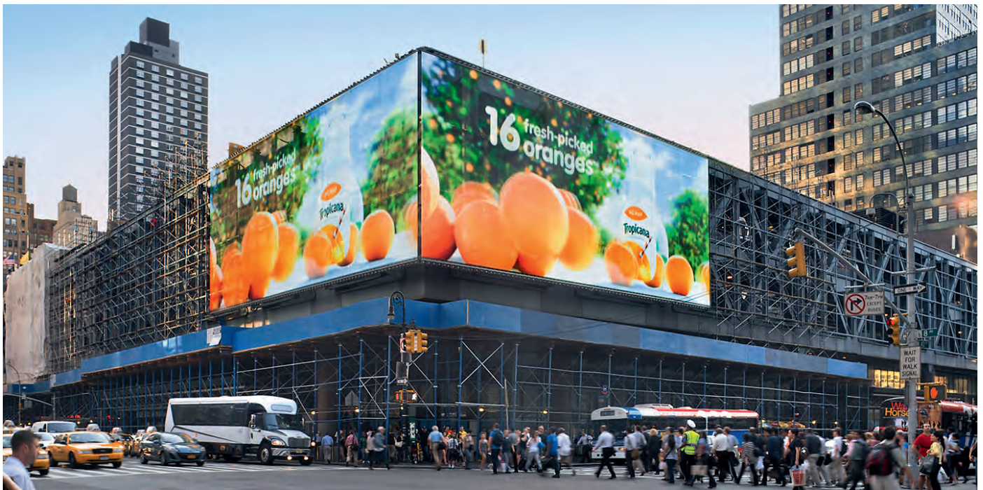
Integrated micro-LED lighting systems can create programmed lighting effects for advertising. New York.

steel facades in the January 2012 issue of MolyReview gives more detail on this subject.