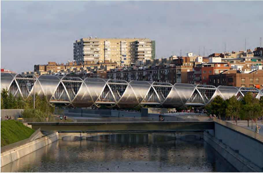
Semi-transparent mesh underlines the airy design of this walkway while providing protection from the elements to pedestrians. Arganzuela bridge, Madrid.

effects of the cold. By day, the sun's rays play on the metal mesh, while at night illumination creates an impressive ramp of light.