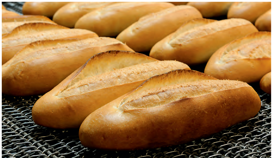
A stainless steel belt conveyor runs these bread rolls through the oven and also serves to cool them after.

Metal mesh is frequently used for screen-printing because mechanical strength and abrasion resistance are essential properties for mesh materials in this process. The mesh must support high tensile stresses arising from the fast passage of the squeegee as it forces the high-viscosity ink through the mesh. For this type of application, Type 316 wires having a diameter of 15 microns are commonly used for the screen’s wefts. Type 316 stainless steel resists the corrosive inks and cleaning solvents that are entrapped in the crevices where warp and weft wires cross. Screen-printing applications range from conventional labeling for pharmaceutical and food bottles to advanced applications required by the semiconductor industry. Here, ultrafine woven metal meshes, for which dimensional accuracy and printing sharpness are imperative, are used to print the masks of printed circuits and mark liquid