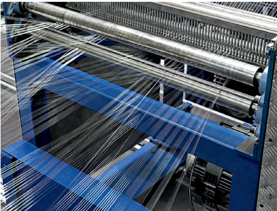
A loom for weaving of stainless steel mesh.

Stainless steel has long been used in architecture because of its aesthetic appeal and longevity. More recently stainless steel mesh made a strong entry into the market because of its remarkable mix of properties. Mesh products can play multiple roles, providing shading while allowing natural light to enter, ventilation while protecting from the elements, and safety while maintaining a pleasing appearance. Mesh offers the designer countless options for customization of buildings, structures and spaces. In many instances it is selected not only for its visual appeal but also for its contribution to energy-saving and sustainable design. The article on energy-saving stainless ▶